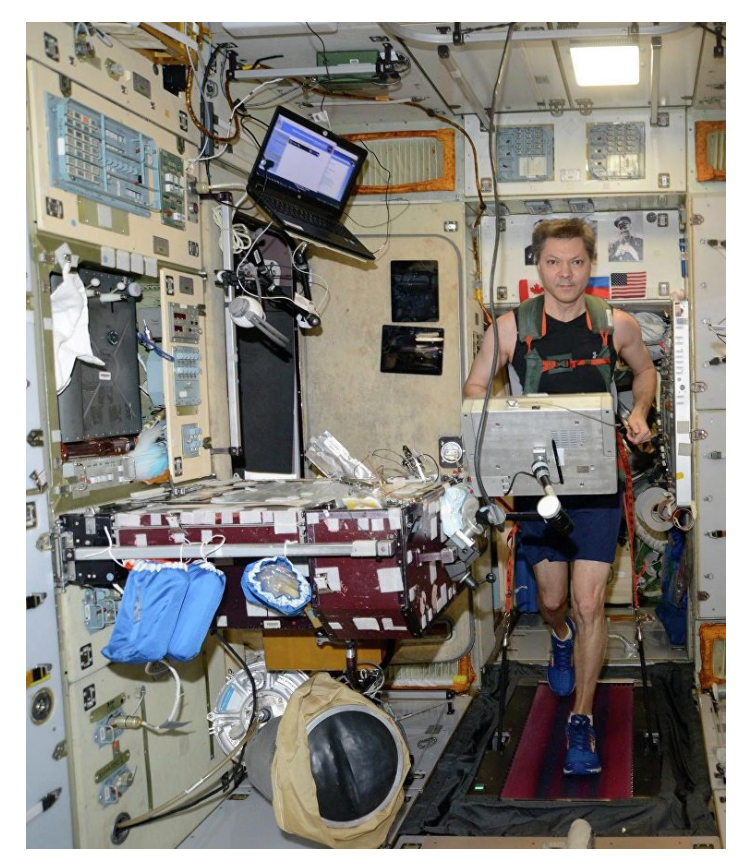
Fig. 1: Historic Photo of ISS Crew BD-2 Exercise.

In order to quantify the impact of this BD-2 exercise, we again focus our attention below 5 Hz and show 16-second interval root-mean-square (RMS) values for five SAMS sensor heads distributed throughout the ISS. For example, Figure ?? shows RMS values computed before (GMT 14:30-14:50) and during (GMT 15:40-16:00) the exercise period and we contrast the median RMS values in those 2 spans with the green and magenta annotations. Results for this sensor along with 4 more SAMS sensor heads distributed throughout the ISS are shown in Table 1 on page 4.